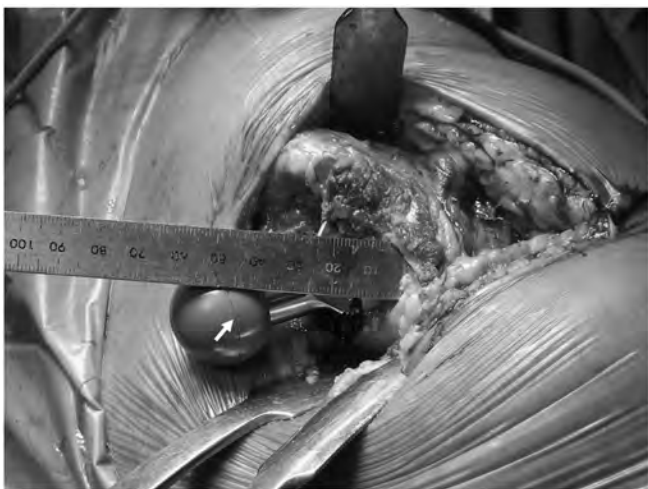
Fig. 2. This photograph shows the intraoperative measurement of the HLD. The arrow indicates the center line of the trial head. The free end of the ruler is located at the superior end of the lesser trochanter.