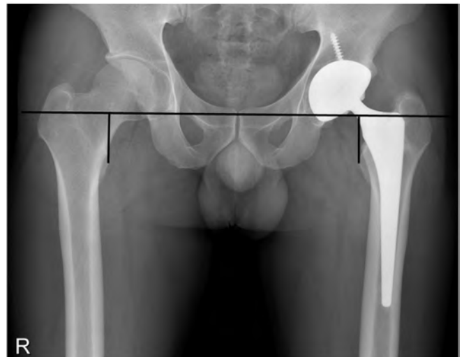
Fig. 3. This radiograph shows the postoperative measurement of limb-length discrepancy.